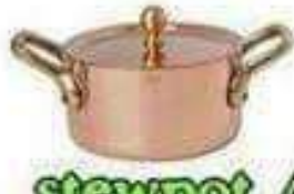
stewpot / cooker