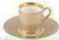
cup and saucer